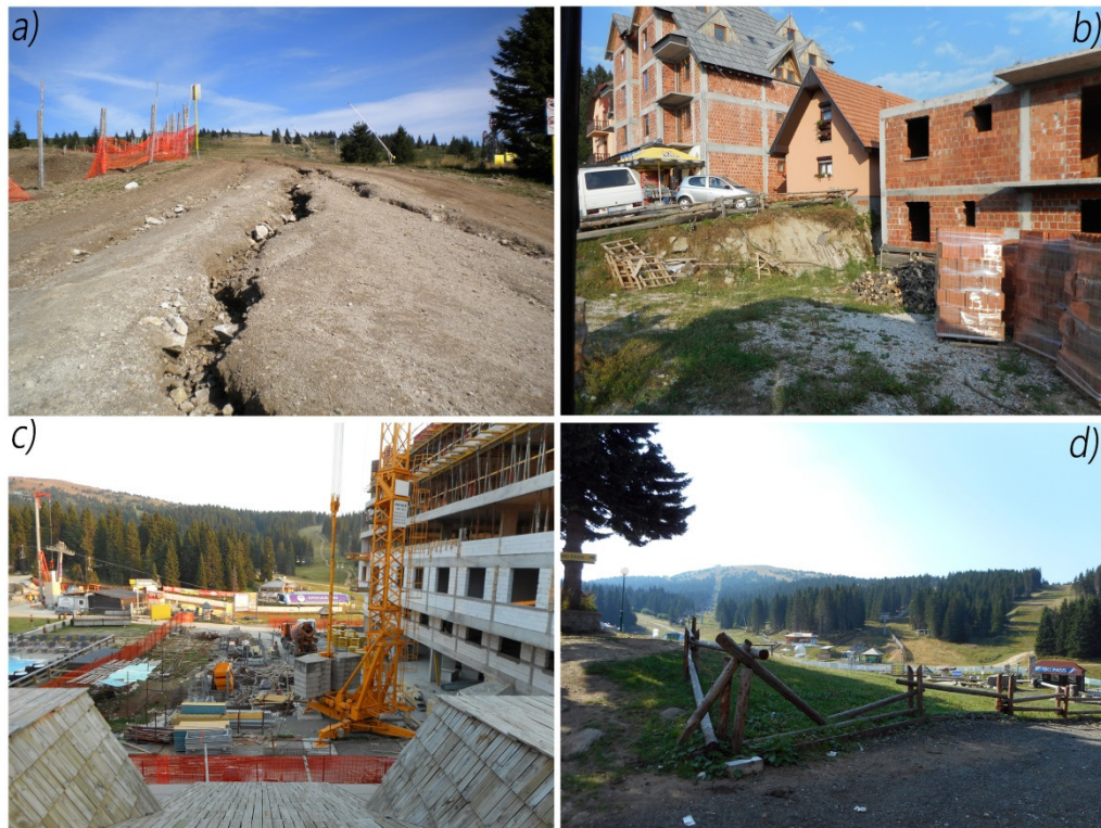
Figure 3. Human impact in Kopaonik ski resort: a) gully on the ski slope, Velika Gobelja locality, (b) building of new accommodation facilities, (c) construction works on new hotel capacities in Kopaonik tourist settlement, (d) roads and cut spruce forests for tourism purposes.