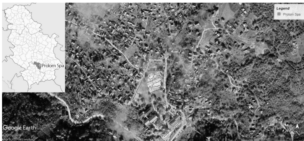
Figure 1. Map of Serbia, Kuršumlija municipality (top); Investigated area of Prolom Spa (bottom).