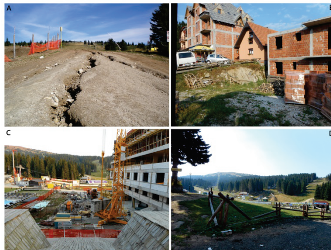
Figure 3. Human impact in Kopaonik ski resort.

Note. Panel A: Gully on the ski slope, Velika Gobelja locality. Panel B: building of new accommodation facilities. Panel C: construction works on new hotel capacities in Kopaonik tourist settlement. Panel D: roads and cut spruce forests for tourism purposes. Adapted from "Can Winter Tourism Be Truly Sustainable in Natural Protected Areas?," by N. B. Ćurčić, U. V. Milinčić, A. Stranjančević, and M. A. Milinčić, 2019, Journal of the Geographical Institute "Jovan Cvijić" SASA , 69(3), p. 249. CC BY-NC-ND.